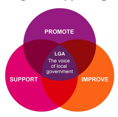
Part 2 - Promoting, improving and supporting local government